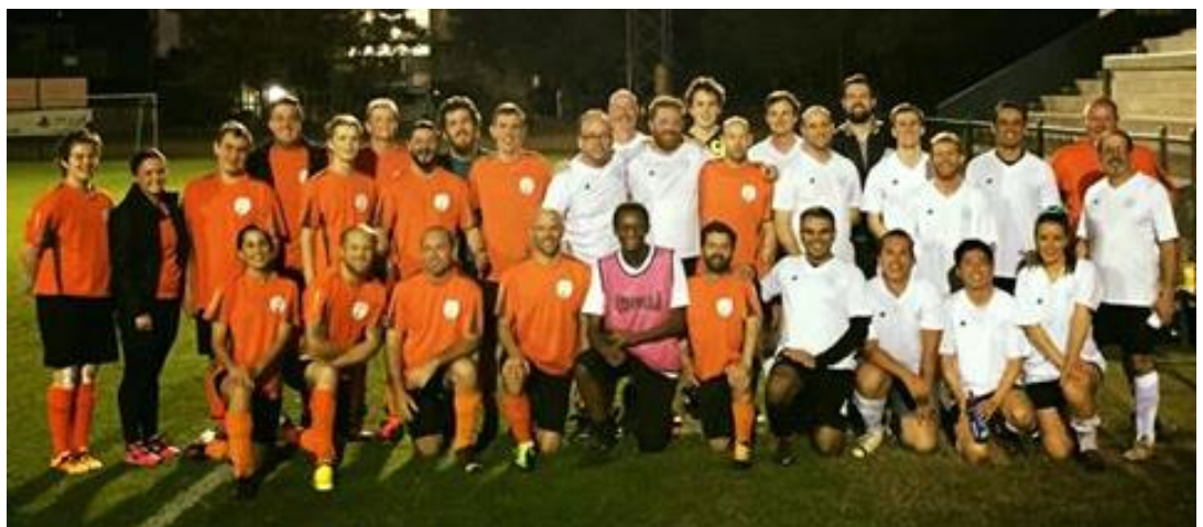
Photo of the team that played in Brisbane , first weekend in July against Prince Charles and Princess Alexandra Hospitals. The charity match was a curtain-raiser to t clash between Brisbane City FC & Western Pride FC.

Check the Facebook page too https://www.facebook.com/transplantaustaliafc/