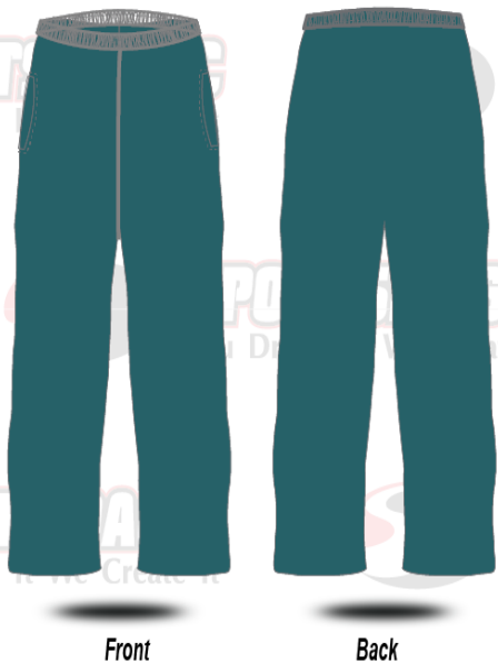
Retro Track Pants (SMTP - no lining)