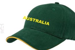
CAP B LL-8001 - BTLE/GLD