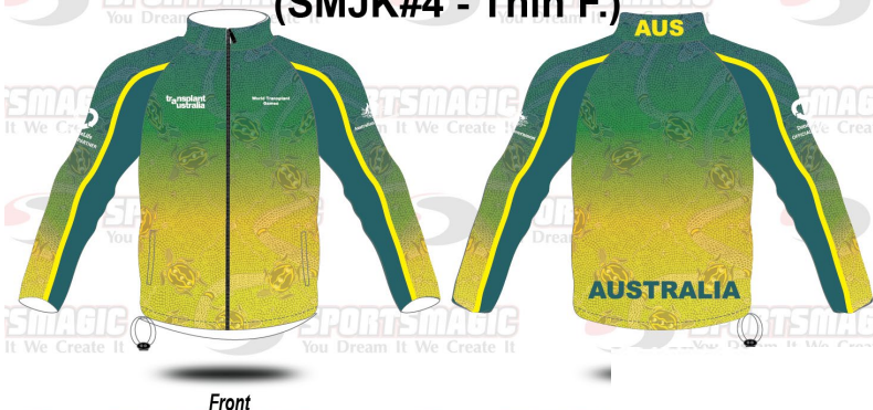
Casual Jacket $95 (SMJK#4 - Thin F.)